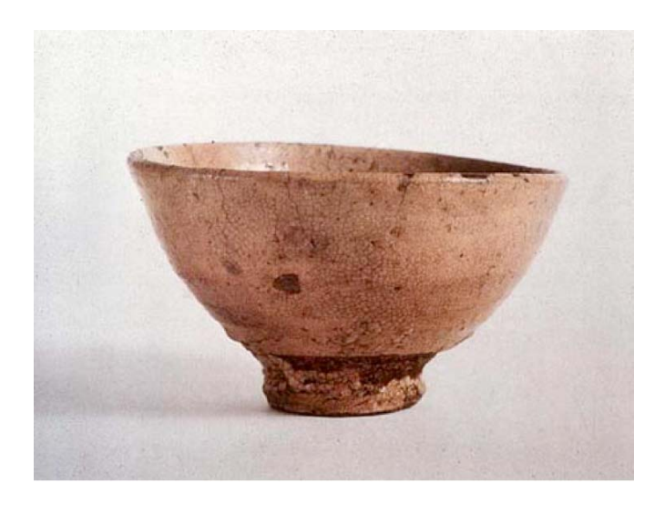
Figure 3 Kizaemon Ido teabowl. Korea. Yi dynasty (sixteenth century) Height: 8.8 cm

What distinguishes a genuine Tea bowl, Yanagi informs us, is not that it is made for the purpose of Tea but rather that it is, based on its natural and inherent beauty, adapted for the use of Tea. As Yanagi puts it, "The seeing eye and the using hand made tea utensils from ordinary objects" (180). Yanagi is referring here to the traditional and highly prized meibutsu Tea bowls, the finest of which are of Korean provenance, and not the more modern Japanese creations which are contrived and only imitate the simplicity and irregularity which are key features of the best pieces. The bowl shown here illustrates just how closely the Zen philosophy of emptiness and Zen virtues of poverty, humbleness of mind, and forswearing of worldly attachments are tied to the selection of the Tea bowl.