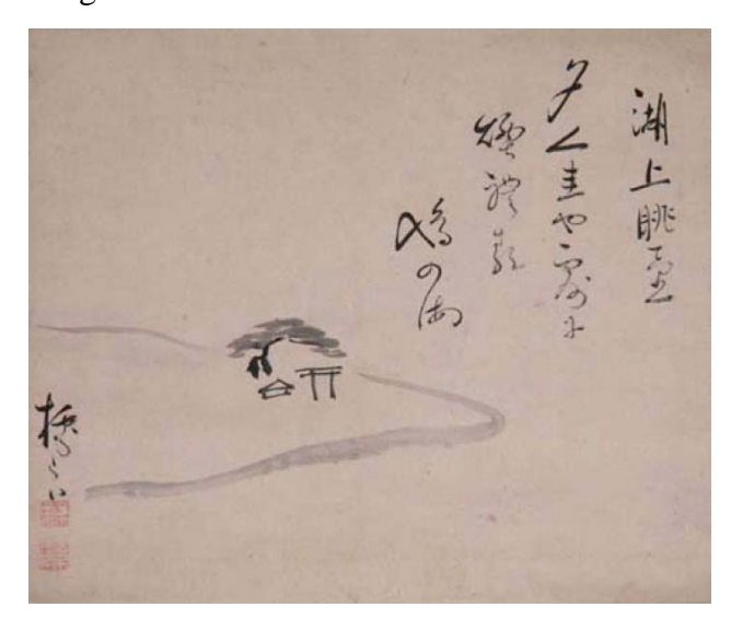
Figure 1 Miura Chora, a poem-picture known as haiga

This "outward form" of mu that Yanagi is referring to can clearly be found in the art of the ink painting, or sumie , the origins of which can be traced back to a practice begun in Chinese Buddhist monasteries thirteen hundred years ago (Deguise) and later carried to Japan. Two very different works can help us to identify the Zen element in sumie art, the first a haiga , or form of poem-painting, by the eighteenth-century haiku master Miura Chora, and a more recent scroll sumie by the Zen Buddhist monk Nantembo, who straddled the nineteenth and twentieth centuries. It is interesting to note, at the onset, that a characteristic of sumie is just this association, not with professional artists, but with monks and poets who turn to it as an expression of an inner search or insight and not as a work of art in itself.